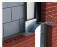
Parabolic Arch Lintel