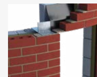
Curved On Plan Lintel