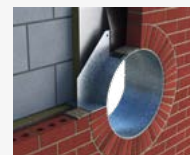
Bull's Eye Lintel